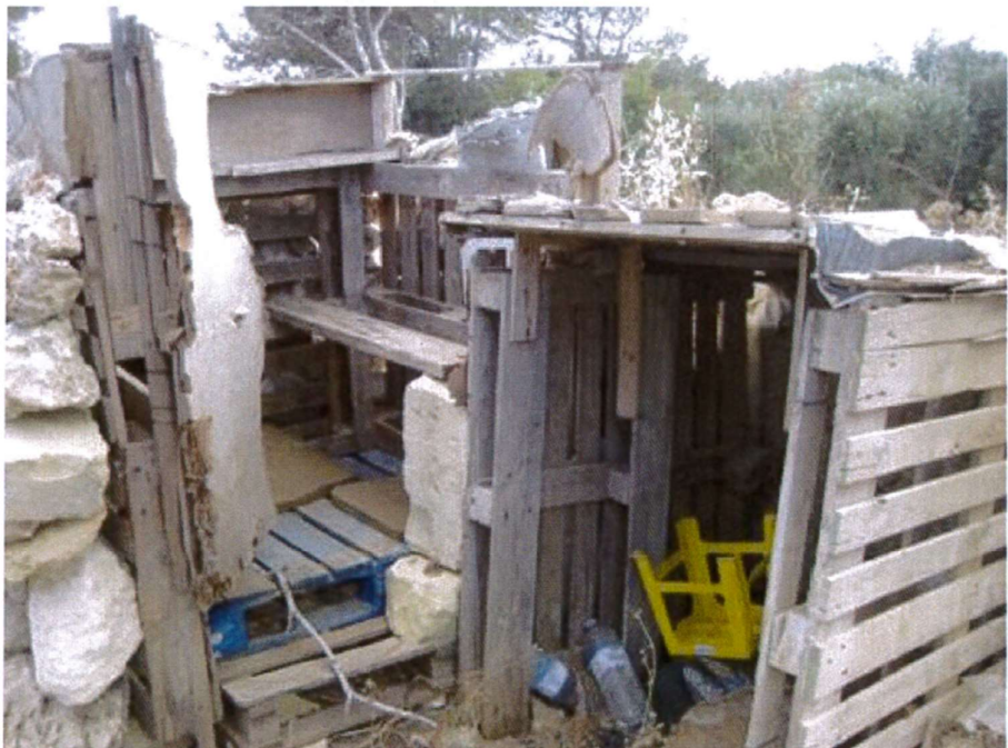
Images 5 & 6. Some illegally built hides are freshly built and made of concrete whilst others are ramshackle collections of wood, stone and rubbish.